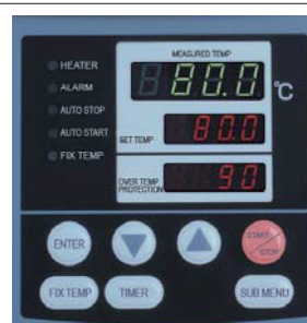
BK series control panel