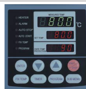
BA series control panel